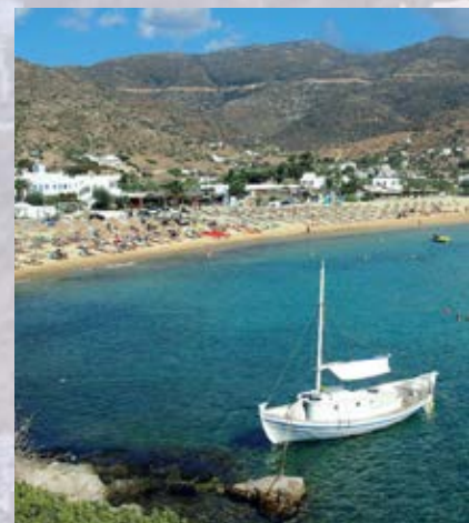
Milopotas Beach, Ios

Please see our website for further details.