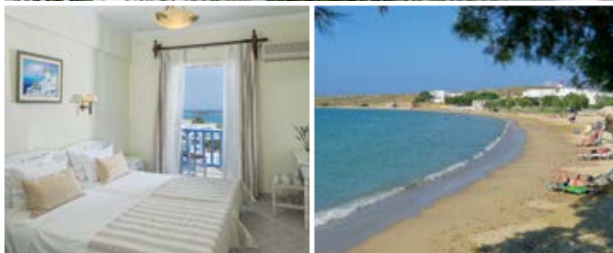
Agii Anargyri Beach